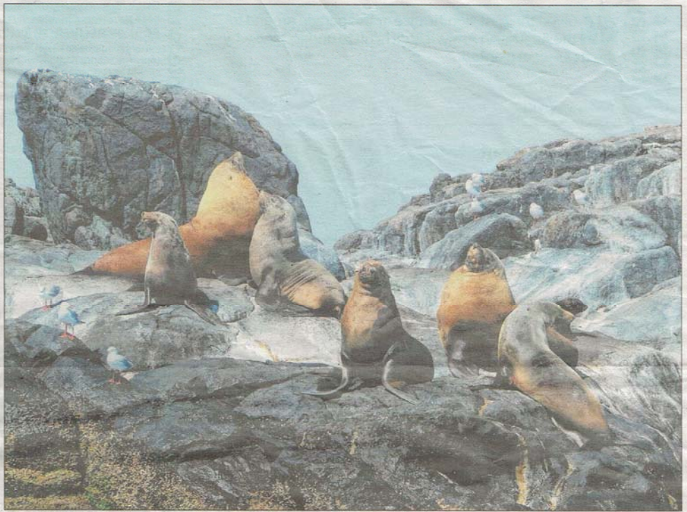
Fur seals and cubs frolic on Montague Island, off Narooma, on the South Coast.

We come to an enclave of numbered boxes and as Ian hands out maps, record